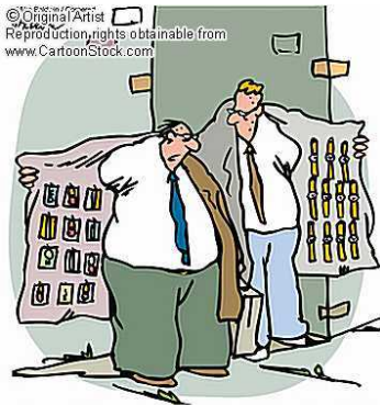
"Sure, I'll buy a watch. You take plastic?"

I wonder how much debt the people of Australia will be in when Christmas 2007 is over. In October Australians owed 21.5 billion on credit cards. If we manage to continue with the yearly trend it will be higher than that after Christmas.