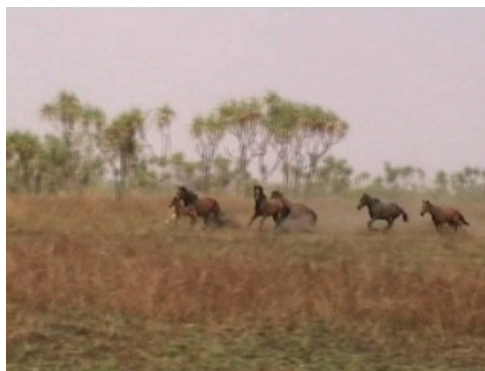
Wild Brumby's in the NT

We do not go pretending to have all the answers for the indigenous people and the many problems they face on a daily basis but we go hoping to bridge the gaps (even if it is only a tiny bit), to learn of their plight, to grow in our understanding, to appreciate the circumstances they face and to offer a hand of friendship.