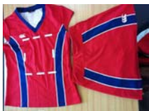
Top #s: 10 & 15

The Uniforms below have been loaned to Primary Students in Yr 5 & 6 HZSA or HICES Sport . Please will all students who were in a sport team to please check their bedroom floor, under the bed, cupboards, laundry, school bag and car. If you find one PLEASE, PLEASE return them to Mrs Cornick no questions asked!