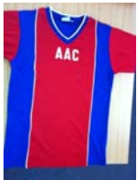
College Sport Shirt

#s: 1,2,8,9,17,19,21 22,25,27,29,31,34 40,45,46,48,49