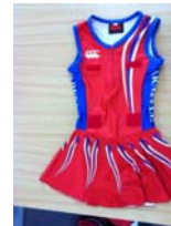
College Netball Dress