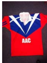
College Rugby Shirt

#s: 1,2,8,9,17,19,21 22,25,27,29,31,34 40,45,46,48,49